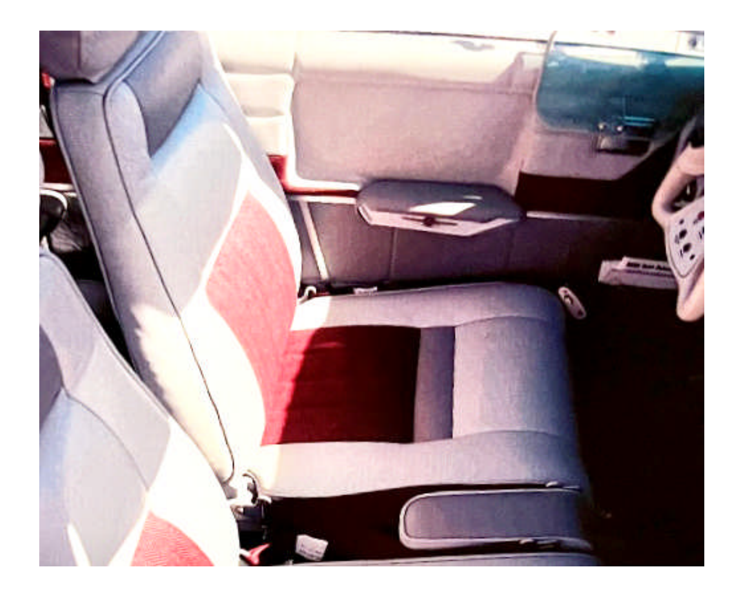
Subject to prior sale, price changes, removal from market and specifications verification